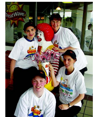
The McDonald's Team poses with Ronald to promote the Silly Boat Regatta 2003. McDonald's was the 2003 Children's Tent sponsor. Mark your calendar the 2004 Silly Boat Regatta is Sunday, July 18 th . www.sillyboat.com