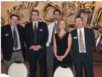
Leadership (BC) Nanaimo team