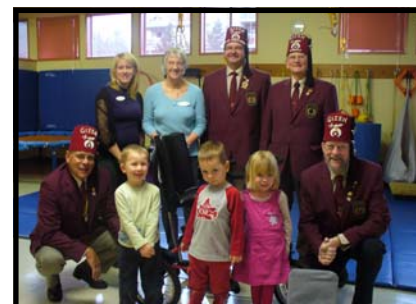
Members of the Shrine Club #10 visit the Centre

Many families benefit from the donations made by the Nanaimo & District Shrine Club #10 through their generous donation for therapeutic equipment. Their efforts to support families extends to providing transportation to/from medical appointments through their Care Cruiser Program. Call 1-800-661-KIDS (5437) for further information on their patient transportation program. Our heartfelt thanks go to the many Individuals, Businesses and Service Clubs who have so generously donated to the Centre – too vast a list to mention all by name.